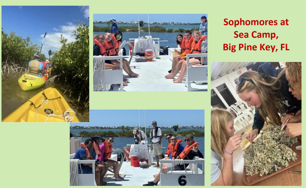
Sophomores at Sea Camp, Big Pine Key, FL